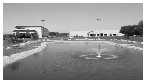
The Camden Falls Convention Center

Discussion sessions are scheduled for Friday, April 20, 2007, 3:15-4:45pm and 8:00-9:30pm. Money, A Memoir ties into the theme of Equity Day, which is “Financially Fit for Life.” There was an article about the book in the Winter 2007 issue of Orbit and you can find